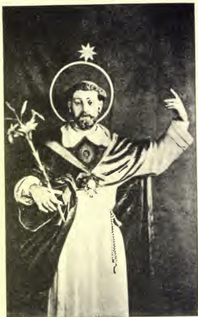
MIRACULOUS STATUE OF SAINT DOMINIC AT SORIANO ( see p. 134 )